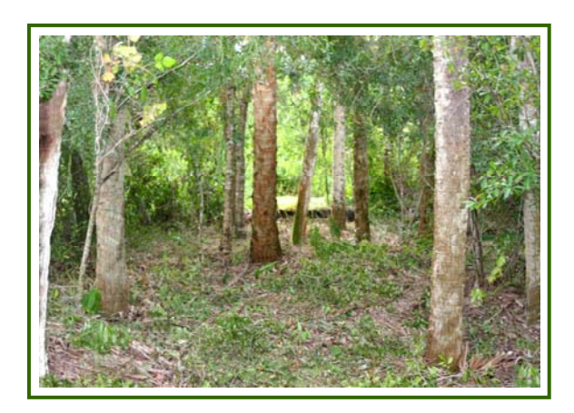
Interior of the Island ~ mature palms & oaks surrounded by a high riverbank.