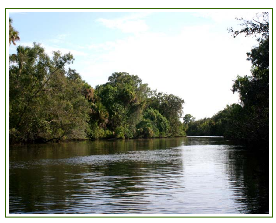
Looking south at the wide river view of this pristine waterway.

The property is fenced & locked. Please contact our office for a viewing appointment.