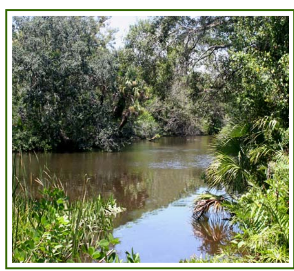
A view of the river from the island's north side.