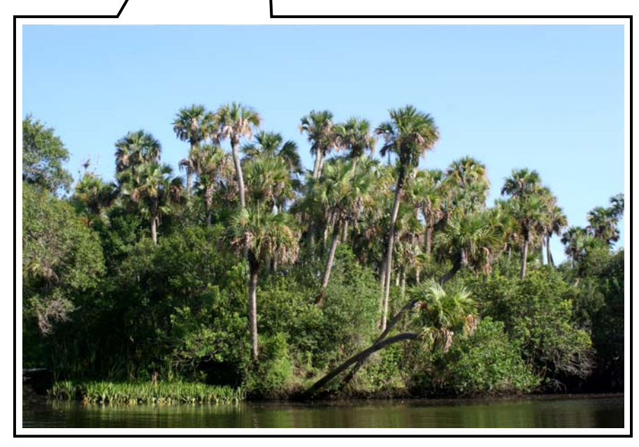
Private Island at west end of property